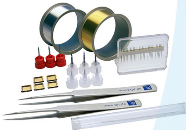
Bond Starter Kit